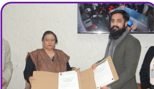
MOU SIGNING WITH SOFTPRO