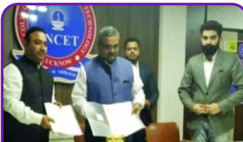
MOU SIGNING WITH RELIANCE JIO INFOCOM IT