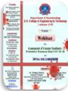
WEBINAR MAY 10, 2020