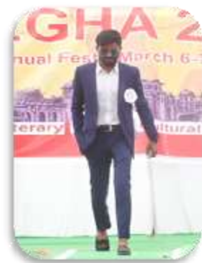
STUDENTS PARTICIPATING IN MEGHA 2K20, BNCET LUCKNOW (MAR 6-7, 2020)