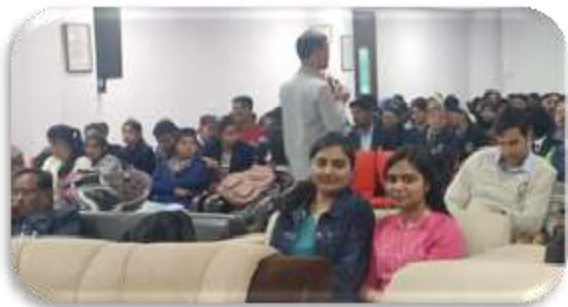
STUDENTS ATTENDING LECTURE SERIES AT SRMT, LUCKNOW (FEB 11, 2020)