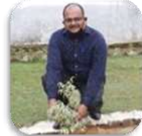
TREE PLANTATION ON WORLD ENVIRONMENT DAY (JUNE 5, 2020)