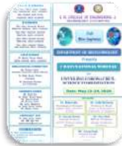
WEBINAR MAY 23-24, 2020