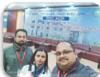
STUDENTS AND FACULTIES ATTENDING INTERNATIONAL CONFERENCE IC3A, APJ AKTU LUCKNOW (FEB 5-7, 2020)