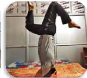
STUDENTS PRACTICING YOGA ON INTERNATIONAL DAY OF YOGA (JUNE 21, 2020)