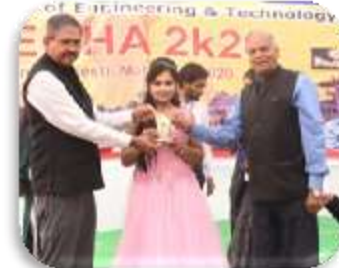
WINNERS OF MEGHA 2K20 IN DIFFERENT CATEGORIES (MARCH, 2020)