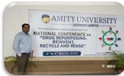
FACULTY ATTENDING NATIONAL SEMINAR AT AMITY UNIVERSITY (MAR 3-4, 2020)