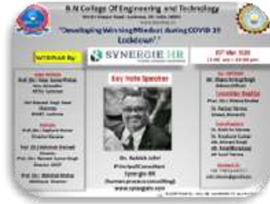
WEBINAR MAY 25, 2020