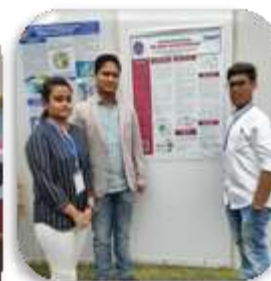
STUDENTS PRESENTING THEIR POSTER AT BIOSANGAM-2020, MNNIT ALLAHABAD (FEB 21-23, 2020)