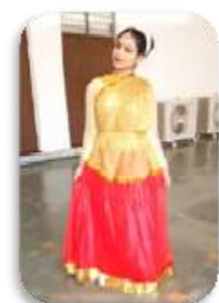
STUDENTS PARTICIPATING IN AKTU CULTURAL FEST, AKTU LUCKNOW (FEB 7-8, 2020)