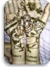
STUDENTS PARTICIPATING IN ONLINE CAMPAIGN TOWARDS COVID-19 AWARENESS (MAY, 2020)