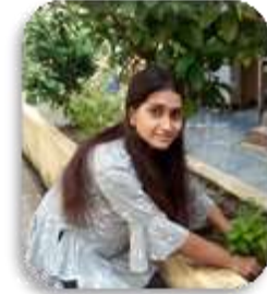
TREE PLANTATION ON WORLD ENVIRONMENT DAY (JUNE 5, 2020)