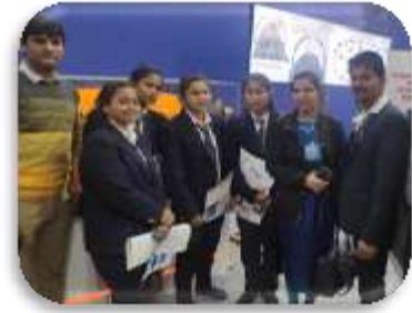
STUDENTS AT DEFENSE EXPO-2020, LUCKNOW (FEB 7-9, 2020)