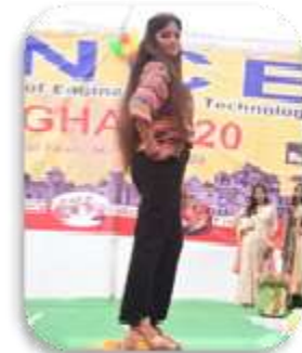
STUDENTS PARTICIPATING IN MEGHA 2K20, BNCET LUCKNOW (MAR 6-7, 2020)