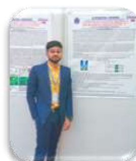
STUDENTS PRESENTING THEIR POSTER AT BIOSANGAM-2020, MNNIT ALLAHABAD (FEB 21-23, 2020)